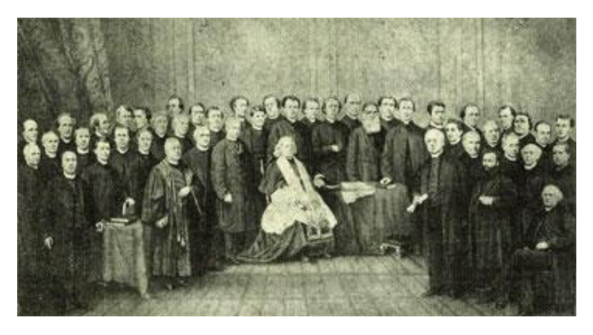
Archbishop Polding, Bishops Willson and Murphy, and other clergy (and laity?) at the 1<sup>st</sup> Australian Provincial Council, Sydney, 10-12 September 1844. There are 46 persons in the photo.

The Council drew up 48 decrees framed in two sections: 4 general and 44 specific. The general decrees urged the bishops to maintain a permanent bond of charity and unity, defend church institutions, and visit all parts of their diocese every two years; while the priests were urged to be mindful of their priestly office, strive for holiness, and provide good example to others. Six decrees focused exclusively on the discipline and life of priests, especially their prayer life, study, dress, recreation, annual retreat, frequent confession, and conferences. Other specific decrees dealt with the administration of the sacraments in general and individual sacraments, particularly Baptism, Mass and Eucharist, Penance and Matrimony (with much detail and strict record keeping). Other decrees addressed the 'Churching' of women, the reservation of sins, preaching and catechetical instruction, the erection and visitation of schools, devotional practices, a local liturgical calendar, the obligation of regular Mass 'pro popolo', and a register of deceased faithful.