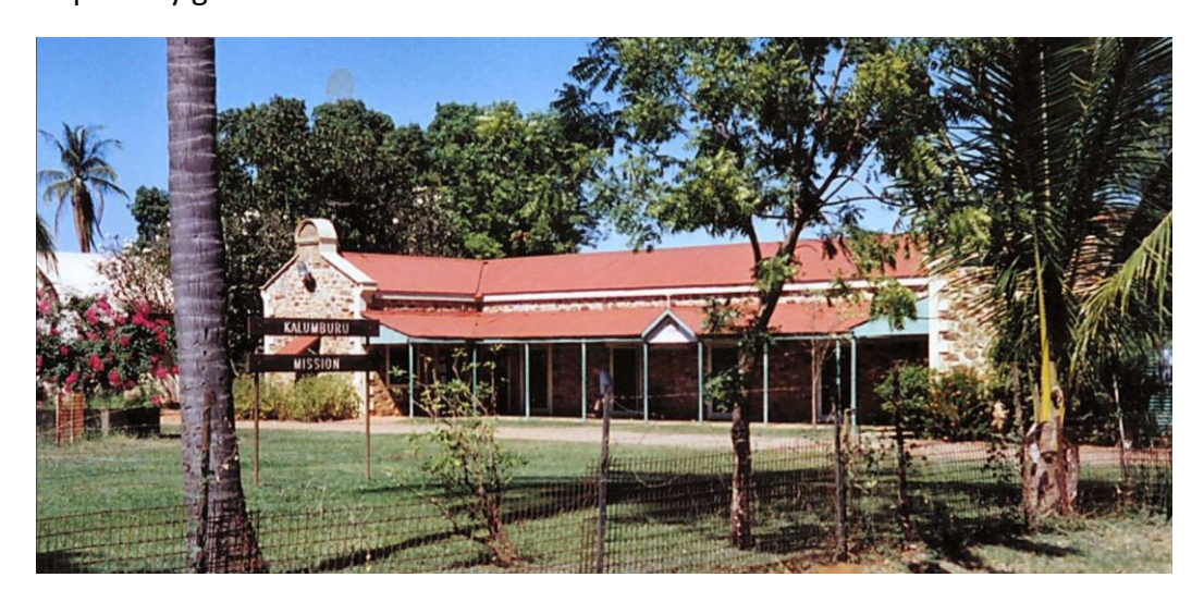
Image: Benedictine Aboriginal Mission at Kalumburu, WA, transferred from Drysdale River (Pago) in 1971

Abbot Torres's offer to establish a new mission in the Kimberley Vicariate with 'nullius' jurisdiction and annexed to New Norcia, was approved by the 1905 Council. In 1906 Torres found a suitable site, uncontaminated by European or other traders, at Drysdale River, obtained a 50,000 acre native reserve from the WA Government and, with the Holy See's approval, established a priory mission at Pago in 1910 (moved to Kalumburu in 1971) with its primary goal the "conversion of the wild tribes around them".